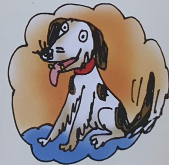
a dog ...