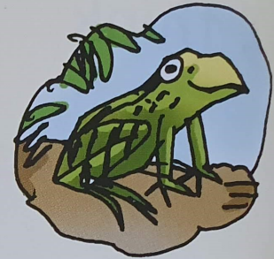
a frog ...